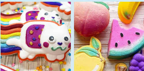
One-of-a-kind bath and shower fizzes from Fizz Soakery in Paris