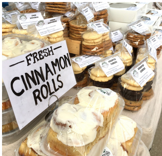
Kristi's Market Kitchen

Satisfy your cravings for local passion at Kristi's Market Kitchen! Local produce, seasonal pies, tarts and much more! Also, stop in for coffee or a lunch to go!