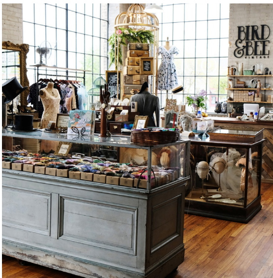
Bird & Bee Vintage, Paris Wincey Mills