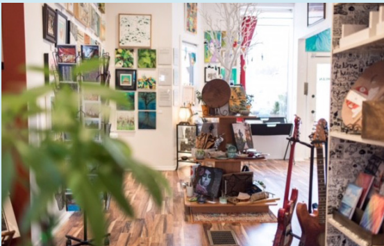
The Paris Bohemian Art Gallery

Specializing in professional dog grooming for all size breeds.