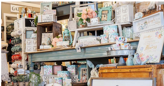
Dragonfly Landscape Supply Inc.

We are a vintage-inspired gift shop that specializes in one-of-a-kind treasures, fashion accessories, antiques, and local handmade goods. Visit our shop at Wincey Mills downtown Paris.