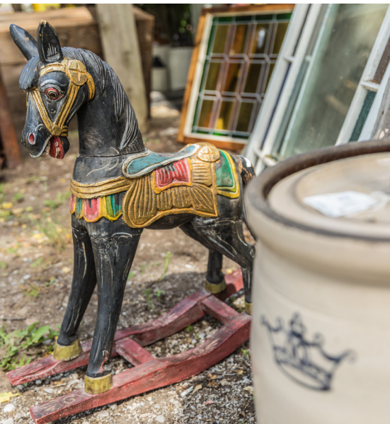
Find a unique treasure at Crossroads Antique Market

We are a small family owned floral and gift shop that has exactly what you are looking for to make your next occasion memorable. We offer same day delivery in Burford and nationwide flower delivery for those planned surprises.