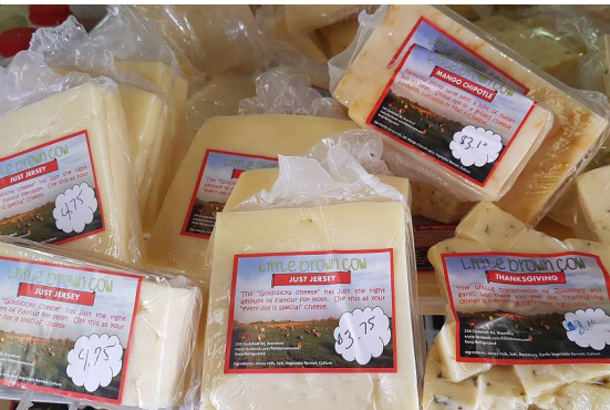
Little Brown Cow