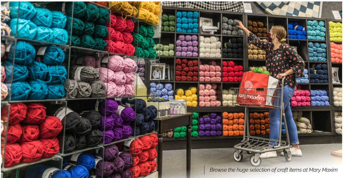
Browse the huge selection of craft items at Mary Maxim