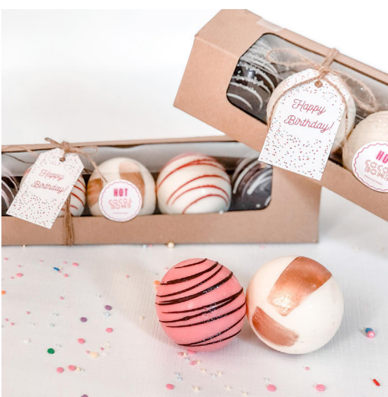
Treat yourself or gift it up at The Cocoa Bomb

We are a family farm growing apples, berries, plums, vegetables, and flowers. We can connect you with fresh local Ontario produce and are open year-round for pick up, delivery and online services.