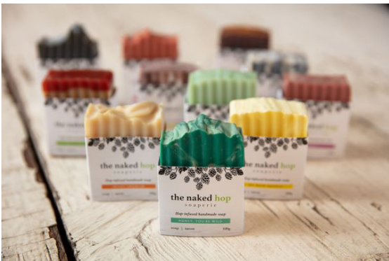
The Naked Hop Soaperie